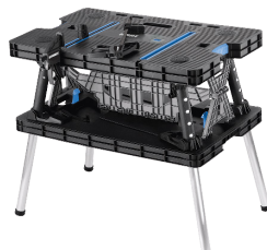
Work Table & Clamps