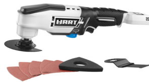
Multi-Tool with a Sanding Pad