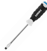
Flat Head Screwdriver