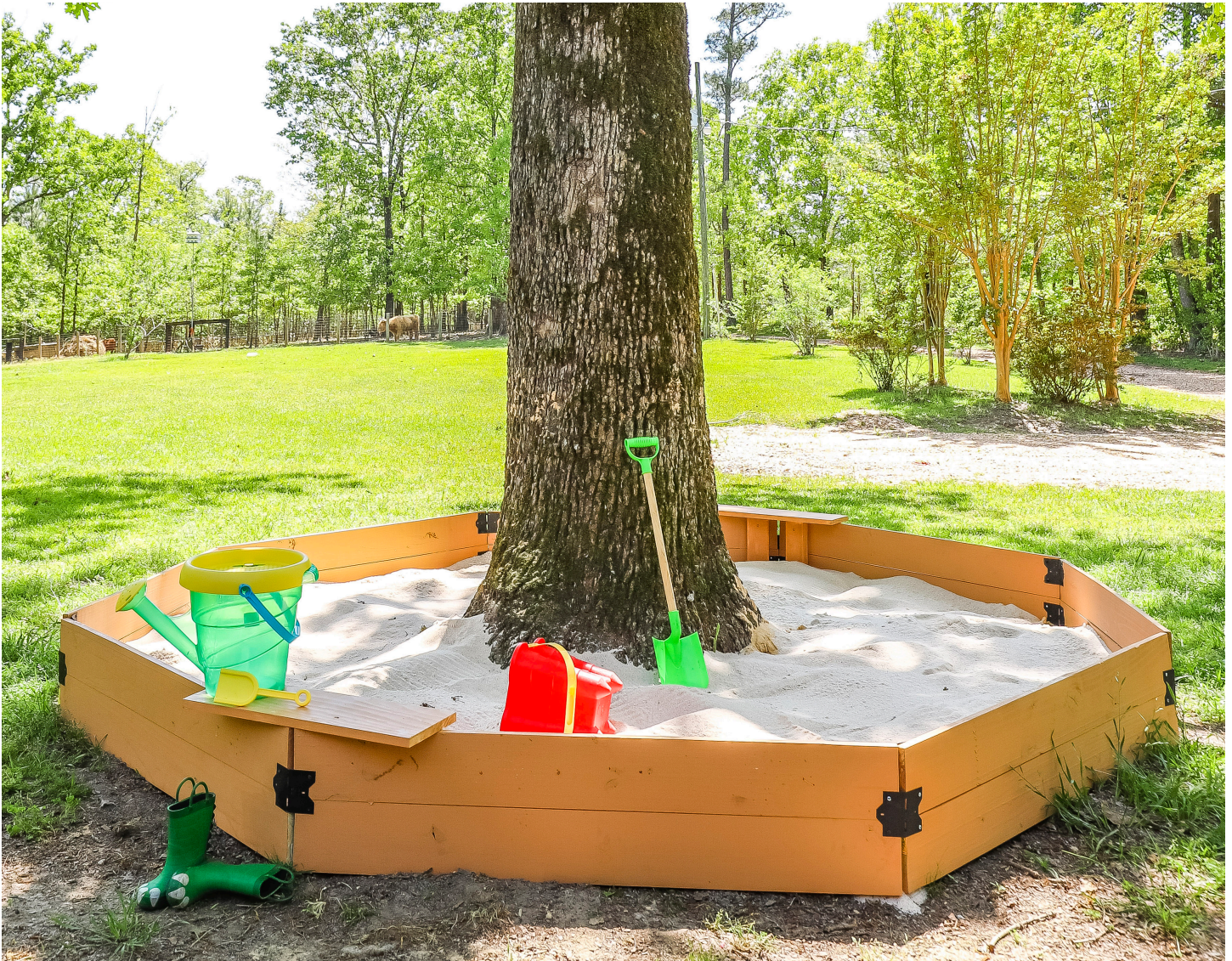
DIY Wooden Sandbox With Seating @SouthernYankeeDiy