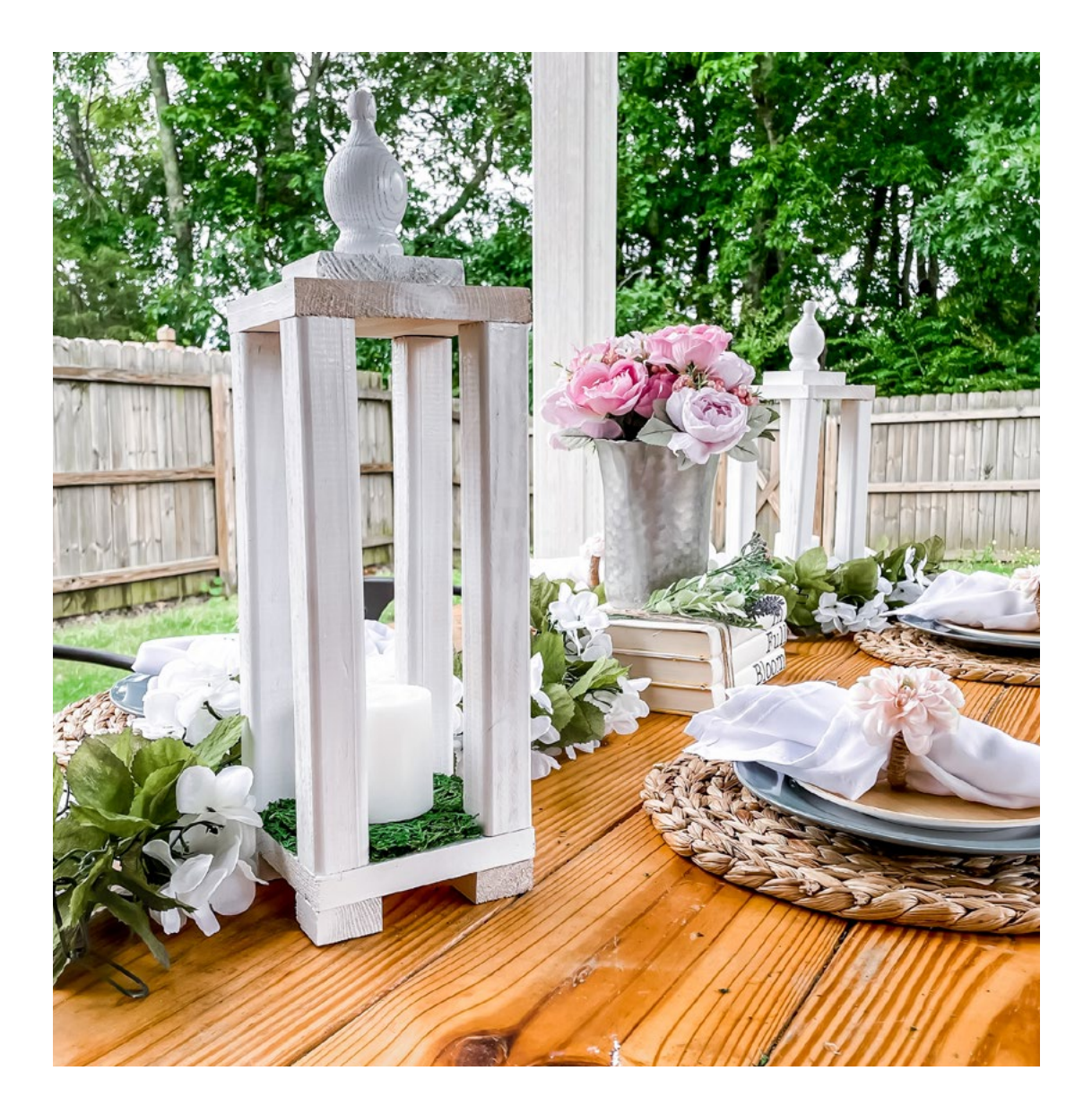
DIY Lanterns