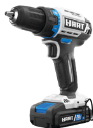
Drill / Driver